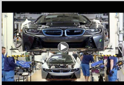
The BMW i8 Production