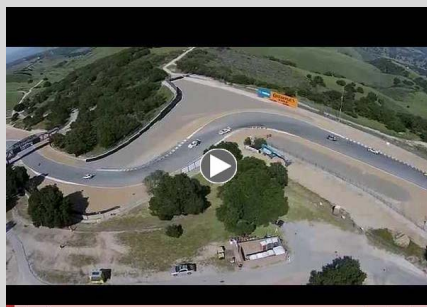
A Blind Crest and a 3 Story Drop: The Corkscrew at Laguna Seca - MOMO