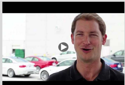
BMW Performance Center Overview

You are cordially invited to our second high performance driving school of 2014 powered by Markert Motor Works. The school is scheduled for the weekend of September 5th- 7th at Road Atlanta. Registration has