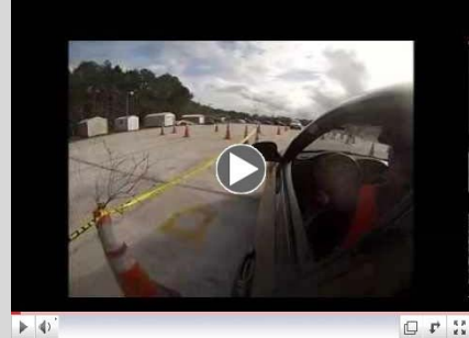
2013 Fall Safety School Video