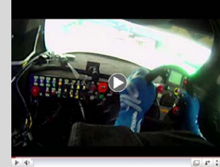
Inside The Cockpit with DysonBMW Design - It Starts with a Sketch