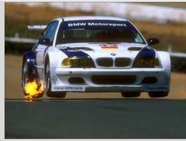
BMW Motorsports Parts