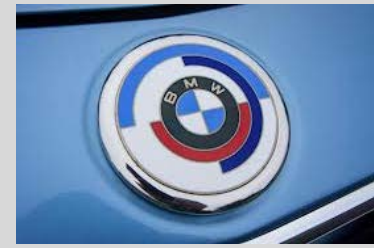
Keep your BMW Original