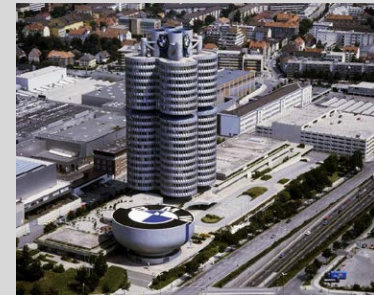
BMW Heritage - Welt