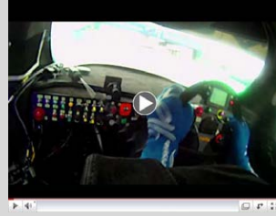
Inside The Cockpit with DysonBMW Design - It Starts with a Sketch