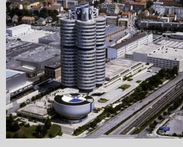
BMW Heritage - Welt