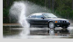
Safety School Video