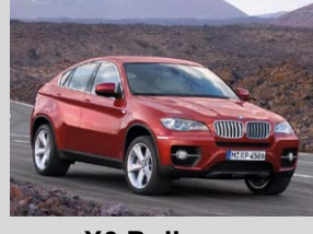
X6 Rollover Test - BMW