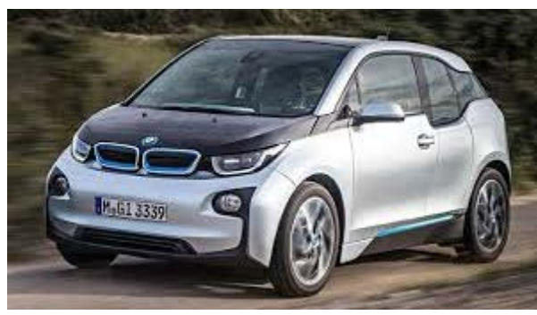
Click Here for I3

As most of you know, the new I3 is coming out soon....check out this clip of it on the track.