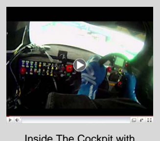
Inside The Cockpit with DysonBMW Design - It Starts with a Sketch