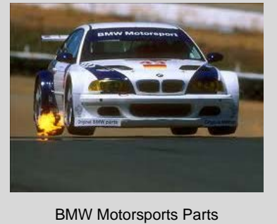
BMW Motorsports Parts