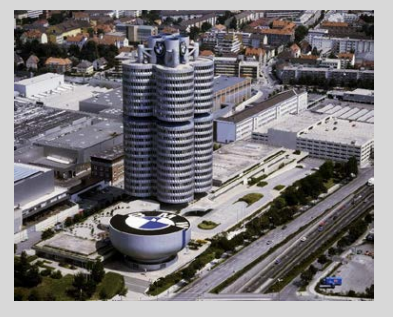
BMW Heritage - Welt