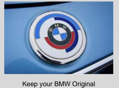
Keep your BMW Original