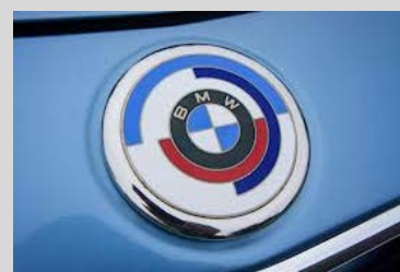
Keep your BMW Original