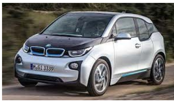
Click Here for I3

As most of you know, the new I3 is coming out soon....check out this clip of it on the track.