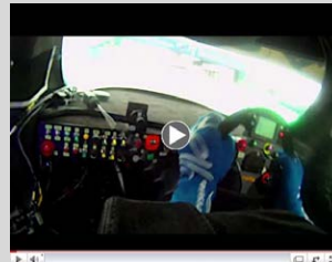
Inside The Cockpit with DysonBMW Design - It Starts with a Sketch