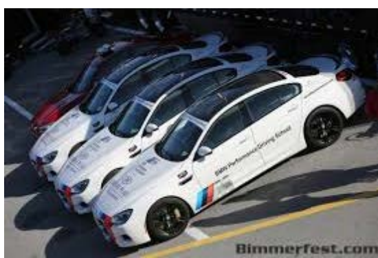
M6 Ride Along

Click on the link to see an in car video of a ride along in an M6 Gran Coupe