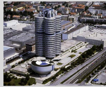
BMW Heritage - Welt