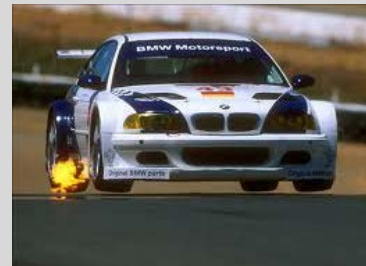
BMW Motorsports Parts